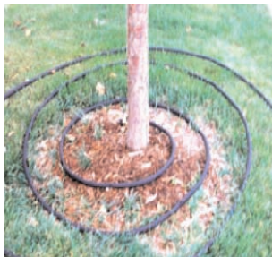
SOAKER HOSE (2 GPM) (50 feet with restrictor)