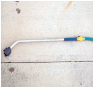
SOFT SPRAY WAND (4 GPM)