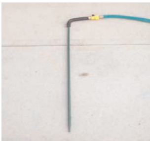
DEEP ROOT NEEDLE (2 GPM)