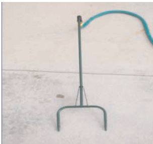
DEEP ROOT FORK (2 GPM)